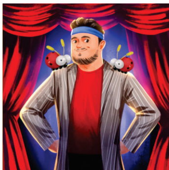
Mojo Magic Show Saturday & Sunday